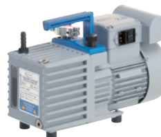
RZ 2.5 2 \times 10^{-3} mbar, 47 Lpm 20698126