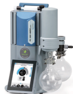
PC 3001 VARIO select 2 mbar, 34 Lpm Self-adjusting 20700203