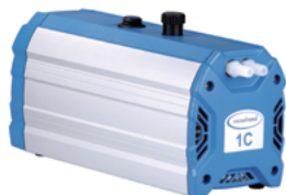
MZ 1C 12 mbar, 14 Lpm high boiling point solvents 20724103