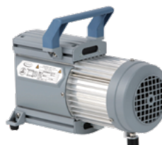
MD 1C 2 mbar, 23 Lpm high boiling point solvents 20696613