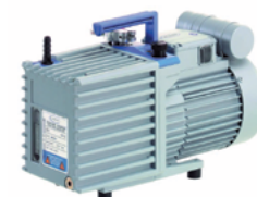
RZ 6 2 \times 10^{-3} mbar, 113 Lpm 20698136